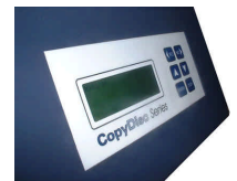
Easy to Use LCD Control Panel