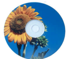
Fastest inkjet printing