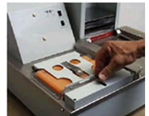
The first seal is made manually

The result is a professionally folded and sealed CD or DVD case suitable for even the best retail presentations and all this for a fraction of the cost of outsourcing.